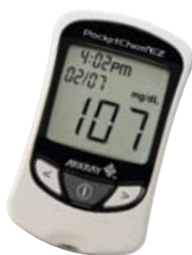
PocketChem EZ (ARKRAY)