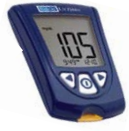
ReliOn® Ultima (Solartek Products, Inc.)