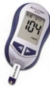
ACCU-CHEK® Aviva (Roche)