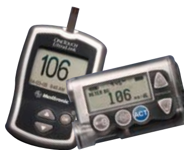
OneTouch UltraLink (LifeScan)