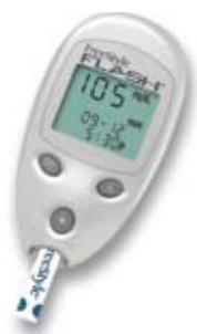
FreeStyle Flash™ (Abbott Diabetes Care)