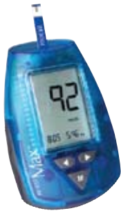
Nova Max (Nova Biomedical)