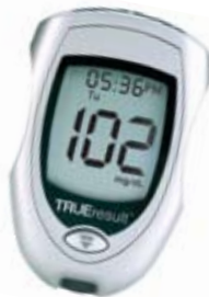
TRUEresult (Home Diagnostics, Inc.)