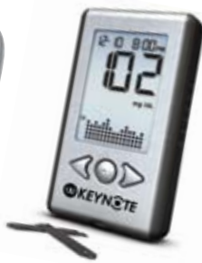
WaveSense KeyNote™ (AgaMatrix™)