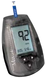
Nova Max Link (Nova Biomedical)