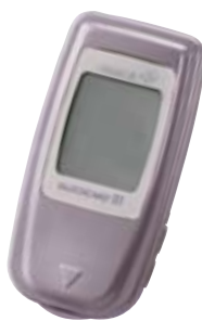
GLUCOCARD 01 (ARKRAY)