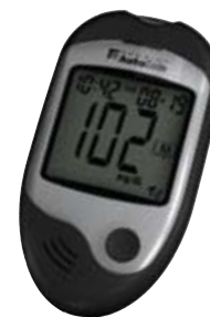
Prodigy AutoCode (Diagnostic Devices, Inc.)