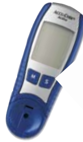
ACCU-CHEK® Active (Roche)