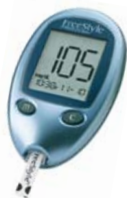
FreeStyle Freedom™ (Abbott Diabetes Care)