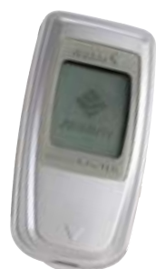
GLUCOCARD X-METER (ARKRAY)