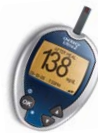
OneTouch Ultra2 (LifeScan)