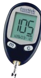
FreeStyle Freedom Lite™ (Abbott Diabetes Care)