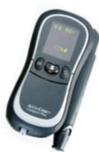
ACCU-CHEK® Compact Plus (Roche)