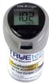
TRUE2go (Home Diagnostics, Inc.)