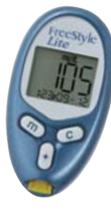
FreeStyle Lite™ (Abbott Diabetes Care)