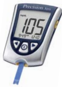
Precision Xtra™ (Abbott Diabetes Care)