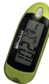
Prodigy Pocket (Diagnostic Devices, Inc.)