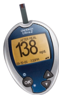
OneTouch Ultra2 (LifeScan)