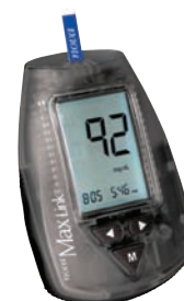
Nova Max® Link™ (Nova Biomedical)