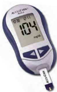
Accu-Chek® Aviva (Roche)