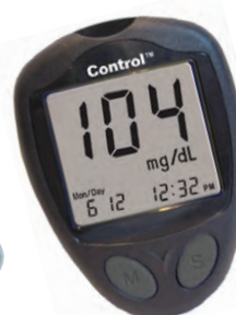
Control AST (U.S. Diagnostics, Inc.)