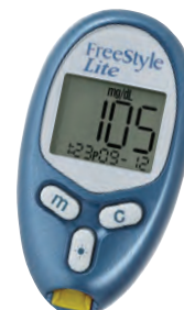
FreeStyle Lite® (Abbott Diabetes Care)