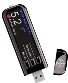
Contour® USB (Bayer)