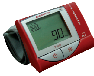
Advocate Redi-Code Duo (Pharma Supply, Inc.)