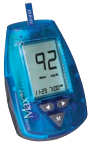
Nova Max® Plus (Nova Biomedical)