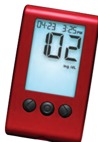
Up and Up (AgaMatrix™)