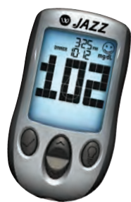
WaveSense™ Jazz (AgaMatrix™)