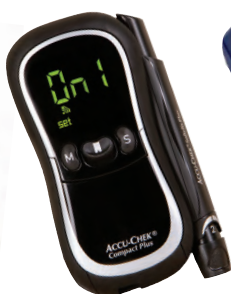
Accu-Chek® Compact Plus (Roche)