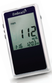
Embrace™ Blood Glucose Monitoring System (Omnis Health)