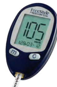
FreeStyle Freedom Lite® (Abbott Diabetes Care)