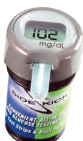
Sidekick® (Nipro Diagnostics, Inc.)