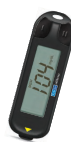
ReliOn Micro (ARKRAY)