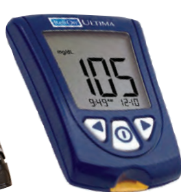
ReliOn® Ultima (Solartek Products, Inc.)