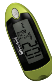
Prodigy Pocket™ (Prodigy Diabetes Care, LLC)