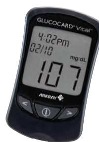
GLUCOCARD Vital (ARKRAY)