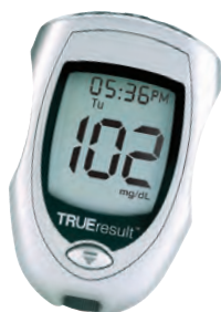
TRUEresult® (Nipro Diagnostics, Inc.)