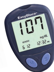
EasyGluco (U.S. Diagnostics, Inc.)