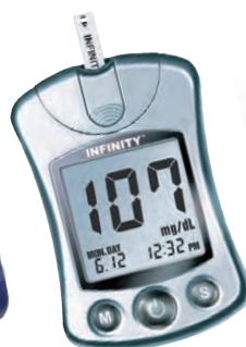
Infinity™ (U.S. Diagnostics, Inc.)