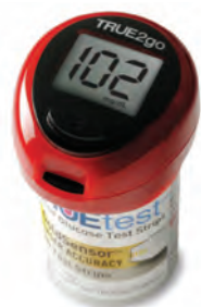
TRUE2go® (Nipro Diagnostics, Inc.)