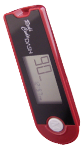
Advocate Redi-Code Dash (Pharma Supply, Inc.)