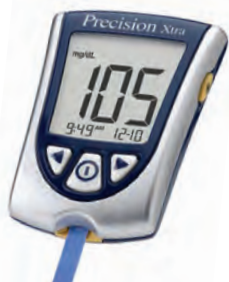
Precision Xtra™ (Abbott Diabetes Care)