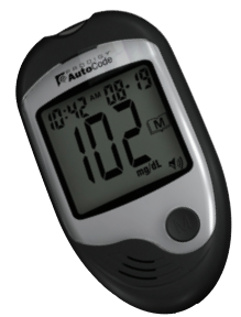
Prodigy AutoCode® (Prodigy Diabetes Care, LLC)